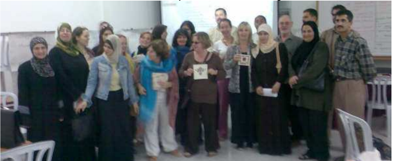
Camden and Abu Dis teachers on the teachers' visit from Camden to Abu Dis, Nov 2007.

This is going to as many teachers as we can send it to in Camden and Abu Dis. Please show this to your friends and colleagues.