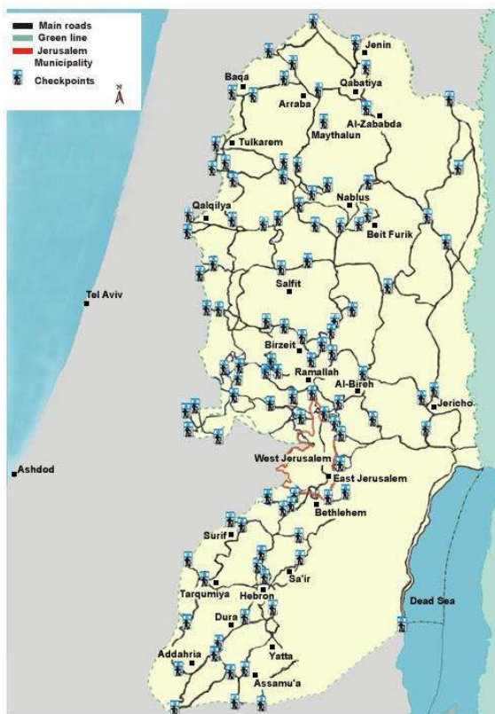
This map shows main fixed checkpoints – There are often temporary “flying” checkpoints

(*Note - The Palestinians are now using the word “mua’bar” (translated into “terminal”) to describe the huge checkpoints, like international frontiers, that are the ways through the Wall. )