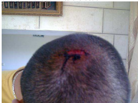
(1) Atta's head showing where the soldier hit him with a gun

They got there at about 11 at night. They parked their car 100 m from the checkpoint in a place where people often park their cars and all of them went down to the beach