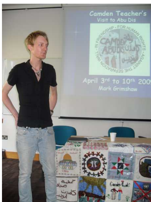
Camden teacher reporting back on visit to Abu Dis (from the CADFA conference in April)

Education links are going strong and we now have four twinings between schools in Abu Dis and Camden and lots of interesting work going on... We have been told that the recent magazine of one of the schools in Abu Dis (Arab Institute) talks a lot about our work and we are looking forward to seeing it!