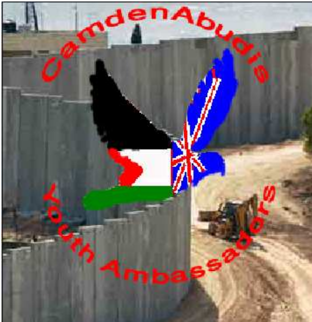
Logo by one of the kids

ON SUNDAY 7 th June , the Camden Youth Ambassadors group will be holding a booksale to help raise money for the visit. Please come along or send a donation to support them – 1pm at Marchmont St Community Centre, Marchmont St WC1. There will be tea and cakes too.