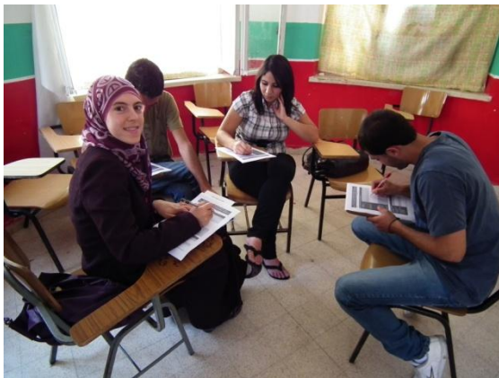
Students in Abu Dis preparing for their visit to London.

During the summer, a group of students from Al Quds University started work on photos and human rights presentations in advance of a students' visit to SOAS, UCL and other universities to meet students from London and do a joint project culminating in a photo exhibition. This project will be funded by Youth in Action.