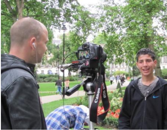
An ex-child prisoner being interviewed for TV during the kids' visit to London in June.