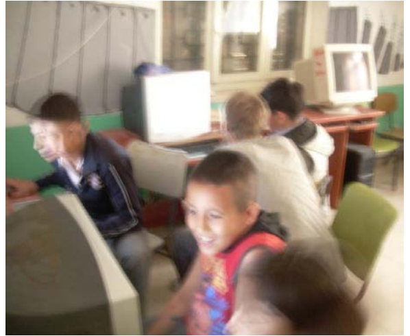
Weather changing in Abu Dis/ Children in Dar Assadaqa