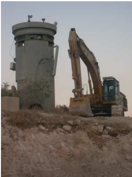
Container checkpoint summer 2008