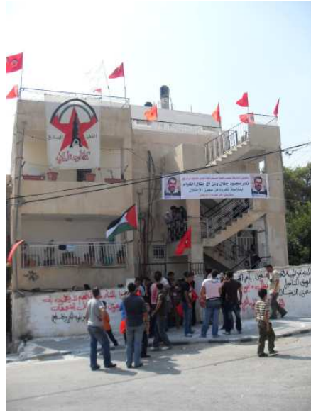
The day of a prisoner release in Abu Dis August 2008

The Israeli violations on the people in Abu Dis continued during August. This month Israeli soldiers attached a student from Abu Dis boys' school, they beat him badly and they arrested him, and on another subject the Israeli authorities gave a new land confiscation decision in order to extend the settlements. Also in this month the Israeli procedures in the area around East Jerusalem became more violent.. This report tells what happened during this August.