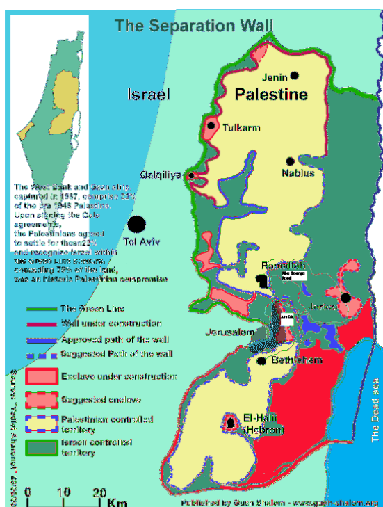
Maps adapted from Gush Shalom

This map shows the limited area of Palestinian control in the West Bank. In fact, Gush Shalom is optimistic in labelling any of the areas “full Palestinian control” – these red areas actually refer to Area A where the Palestinian police operate, but the Israeli army demonstrates its control by coming in regularly, whenever they want to.