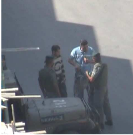
Pictures taken in Abu Dis showing Palestinians stopped in the streets at temporary checkpoints