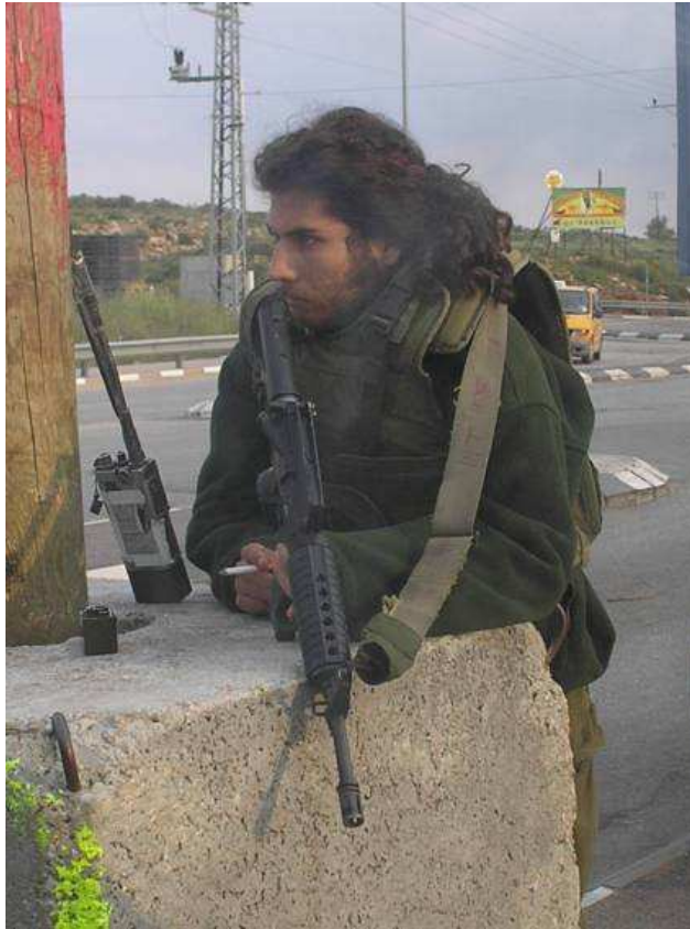
Israeli soldier at a checkpoint outside Abu Dis.