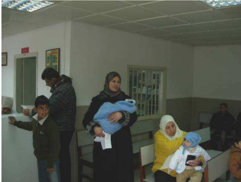
Patients at one of the small Abu Dis clinics on which people depend – the Jerusalem hospitals are the other side of the Wall.