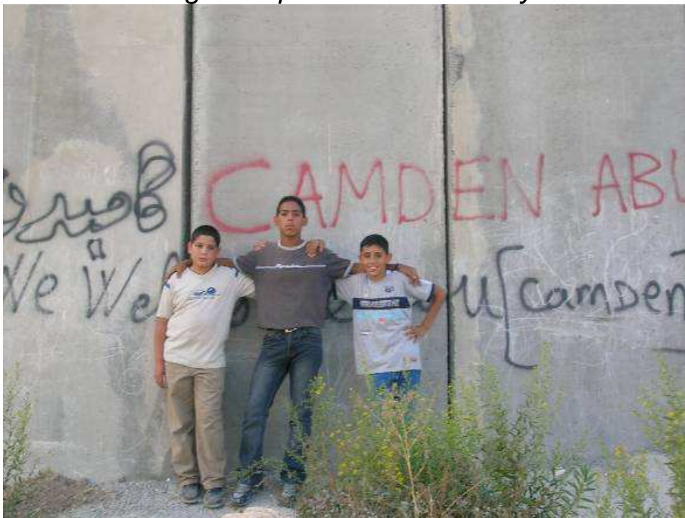
Children from the Dar Assadaqa English class take photos of each other in front of the Separation Wall