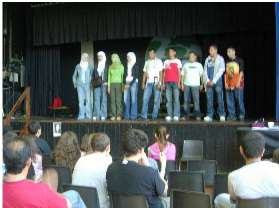
Visits in both directions. Above, Camden and Abu Dis visitors to Dar Assadaqa photographed in April 2006; and Abu Dis children sing a Fairouz song to children at Camden Saturday Music in June 2006.