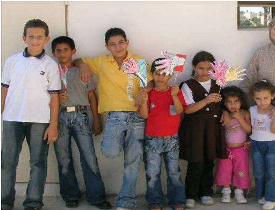
CADFA is proud of the new activities at Dar Assadaqa, many of them for women and children – above, the women’s internet café, and a children’s art activity for Peace Day....